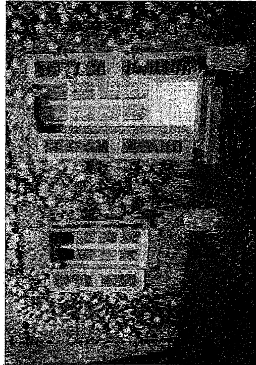
The House with Roses (1936), Henri Le Sidaner. Oil on canvas. Private Collection.

6. chintz: a colorful printed cotton fabric.